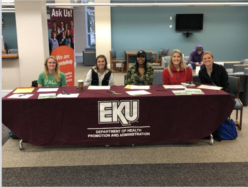
Public Health students helped with the Madison County Health Assessment by handing our surveys around campus!